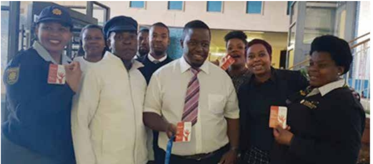
Stakeholders and community members during the outreach event

Community members of Carletonville present at the Oberholzer Magistrate's Court had a brief introduction to state services, particularly SAPS and Legal Aid SA services, which help improve their everyday lives. Legal practitioners from the Legal Aid SA Potchefstroom Local Office were at the court to brief members of the public about how the organisation can help with maintenance matters, specifically spousal maintenance.