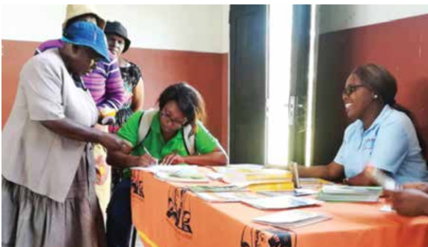
The Legal Aid SA Bushbuckridge Satellite Office assisting the public

Various stakeholders in and around the Thaba Chweu Municipality gathered together to conduct community information sessions in areas they serve in the municipality. Stakeholders such as the NPA; the Departments of Justice, Correctional Services, Transport and Home Affairs; local NGOs and Legal Aid SA joined hands to educate the public and bring services together in one location for the public.