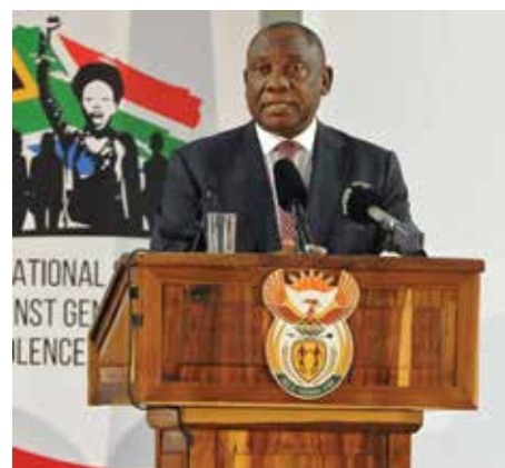
Left: Attendees at the National GBV Summit. Right: President Cyril Ramaphosa addressing the audience