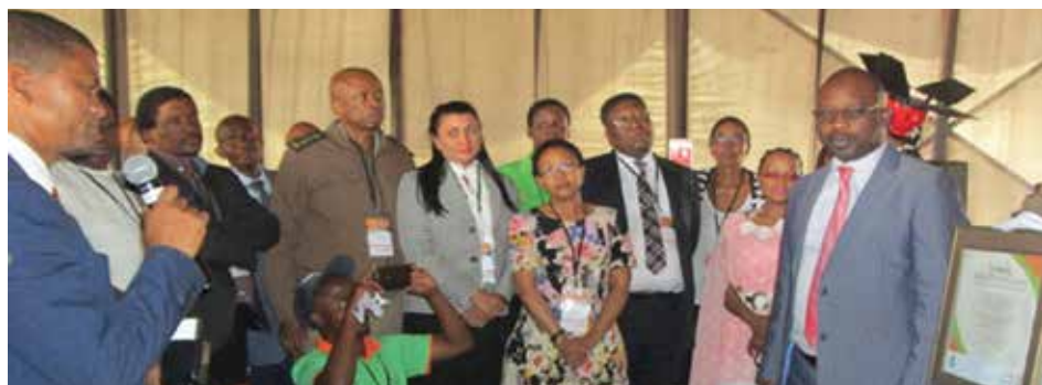
Minister Michael Masutha (far right) officially launching the Botshabelo Sexual Offences Court

Minister Masutha also had an Imbizo with the Botshabelo community, providing an opportunity for locals to interact with the Minister and various state departments.