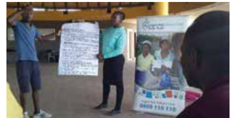
Facilitators address community members

The dialogues gauged the view ordinary community members have of human trafficking, particularly the trafficking of children. The Nkomazi area in Mpumalanga was identified as it is close to the borders of Mozambique and Swaziland; two neighbouring countries linked to cases of human trafficking and related illegal activities.